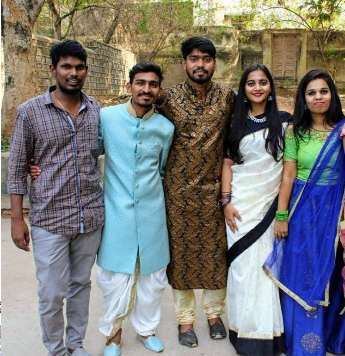
A Constituent College of Usmania University